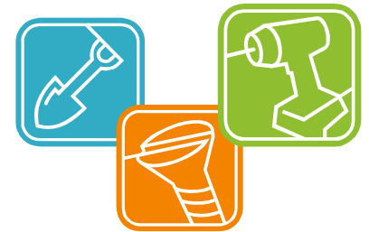
Commercial/Multi-Family Site Development and Building Permit Chart