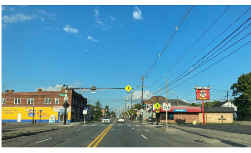
Here's a video explaining how RRFBs work:

Multiple new Rectangular Rapid-Flashing Beacon (RRFB) crosswalks have been installed throughout the city to enhance pedestrian safety. You can find a new rectangular rapid-flashing beacon crosswalk on Lane Avenue on The Ohio State University main campus, and three others on Livingston Avenue, and one each on Lilley Avenue, Wilson Avenue,