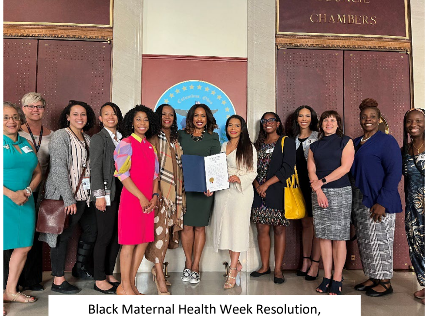
Black Maternal Health Week Resolution,