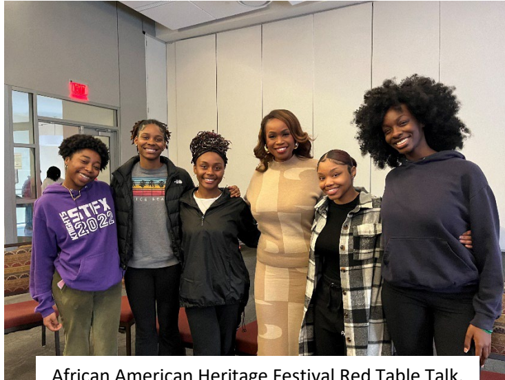
African American Heritage Festival Red Table Talk, April 4 th 2024