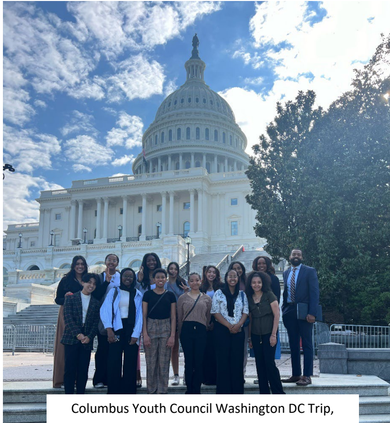
Columbus Youth Council Washington DC Trip,