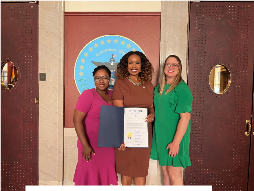
Reentry Week Resolution with ARCH,