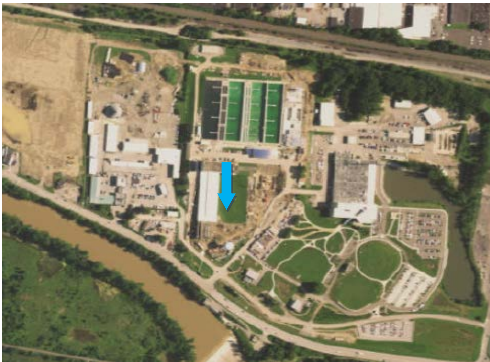
Figure 2. UV Facility location