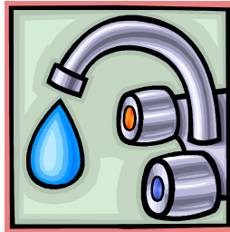
1/16 inch Flow

6,000 GALLONS PER MONTH $70.75 Per Month