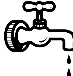
1/8 inch Flow

23,333 GALLONS PER MONTH $275.13 Per Month