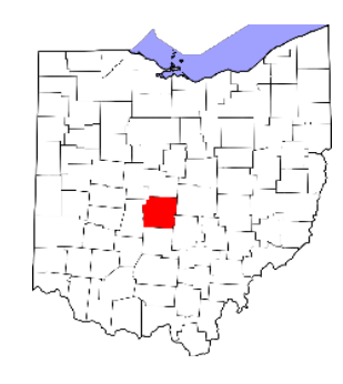
Figure 1. Franklin County