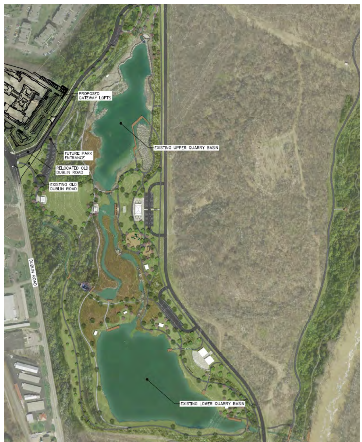
Figure 1 - Site Area Map